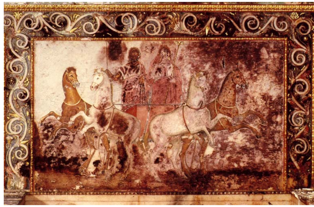
Figure 5: Hades and Persephone in a four horse chariot in a painting from the back of the throne found in the tomb of Alexander's grandmother Eurydice.