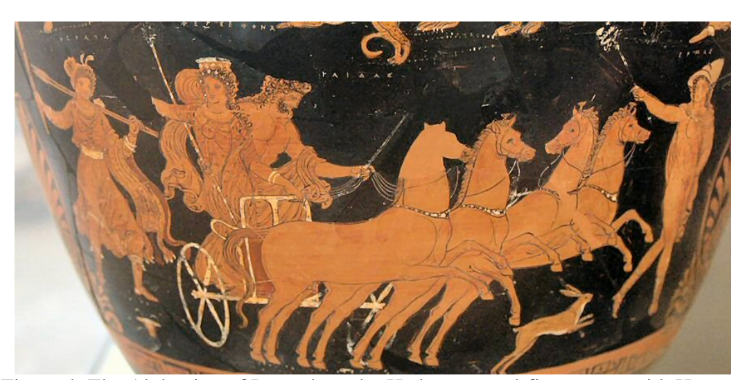
Figure 4: The Abduction of Persephone by Hades on a red-figure vase with Hermes with his caduceus leading the way.

It is interesting also to note that the rear panel of the throne found in the tomb of Eurydice I, Alexander the Great's grandmother, at Vergina/Aegae also depicted Hades and Persephone in a four-horse chariot (Figure 5). This time they are shown as king and queen of the Underworld. This throne had sphinxes and Caryatids as well as this painting. It is turning out to be a microcosm of the Amphipolis tomb and serves further to emphasise the connections between the finds at Amphipolis and the late 4<sup>th</sup> century BC royal tombs at Aegae.