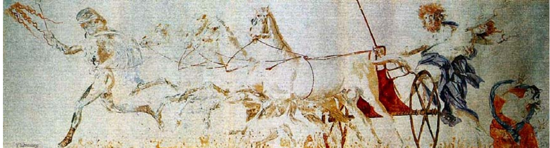
Figure 2: The mural of the Abduction of Persephone by Hades in Tomb I beneath the Great Tumulus at Vergina/Aegae