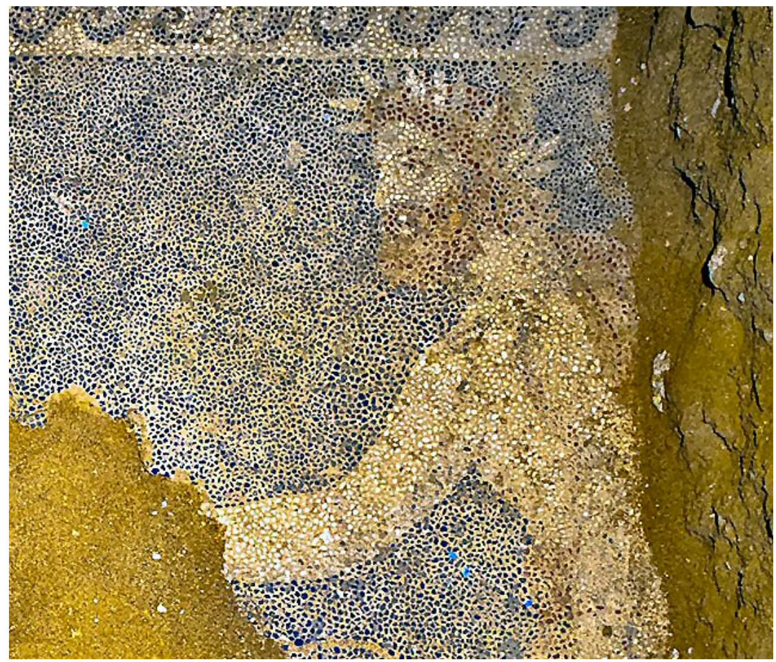
Figure 7: A detailed photo of the Hades figure in the new mosaic: part of the conjectural arm and detail of the possible bracelet in the lower right.