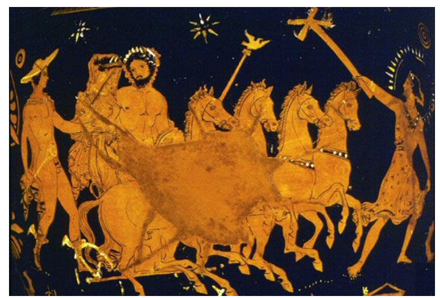
Figure 3: Hades driving Persephone in a chariot with Hermes strolling beside it and Hecate lighting their way from a late 4<sup>th</sup> century BC vase.