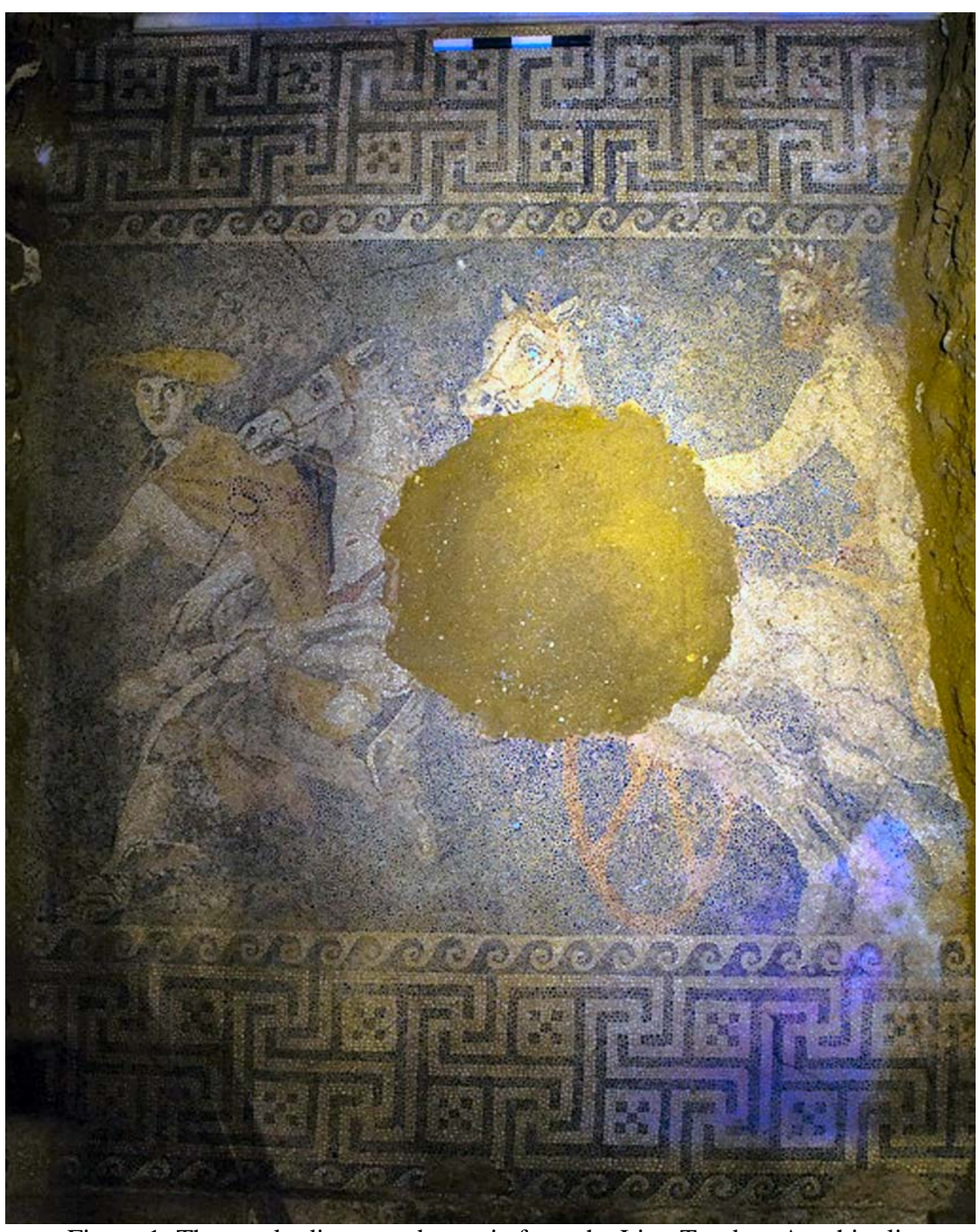
Figure 1: The newly discovered mosaic from the Lion Tomb at Amphipolis